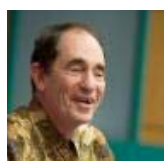
Justice Dr Albie Sachs (Supreme Court Justice of South Africa, ret.) Law & Justice; Human Rights & Dignity

Transitional Justice & Globalisation; Russian Prisons; Sociology of Imprisonment; Human Rights