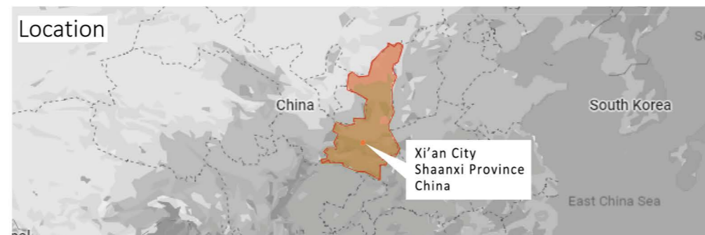
Changes in Shaanxi Steel Factory from 1965 to now Located in Xi'an City, Shaanxi Province, China