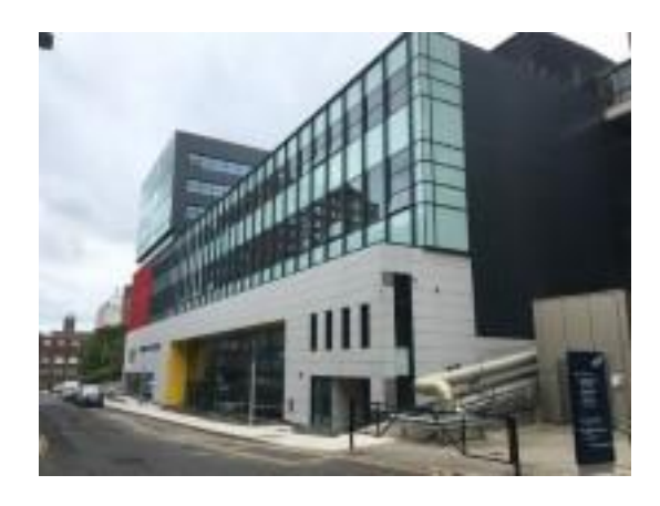
Richmond Street Entrance