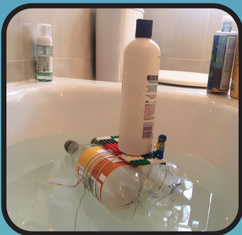
SIMPLE AND STRONG