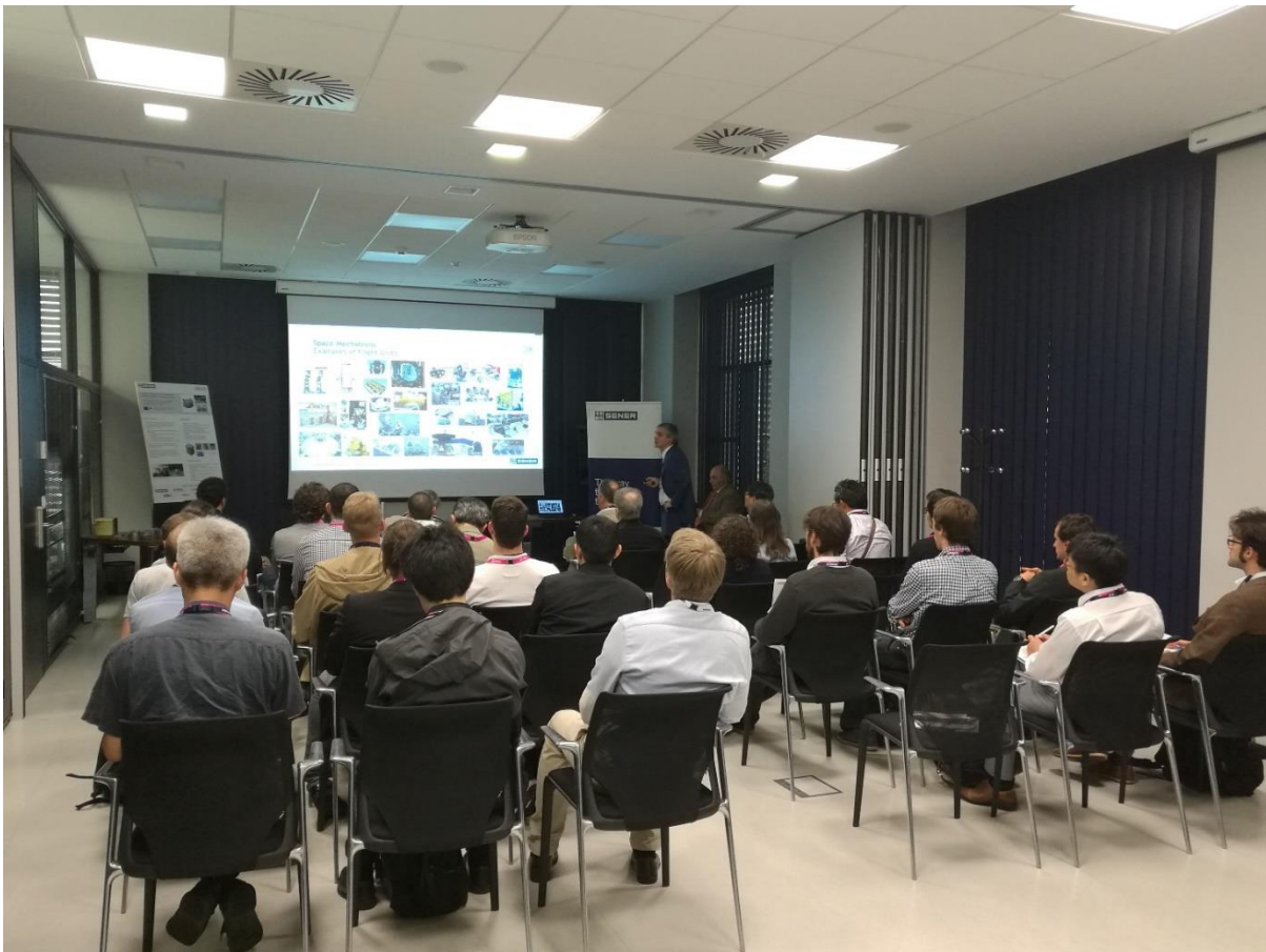
Figure 1 International delegate attending one of the three talks at SENER

The delegates were divided into three groups and visited SENER to learn more about the company and the SIROM project. A partially assembled prototype system has been on display for delegates to view the future European space robotic connector. This event truly promoted the SIROM to international experts from USA, Europe, Japan, China and other space nations.