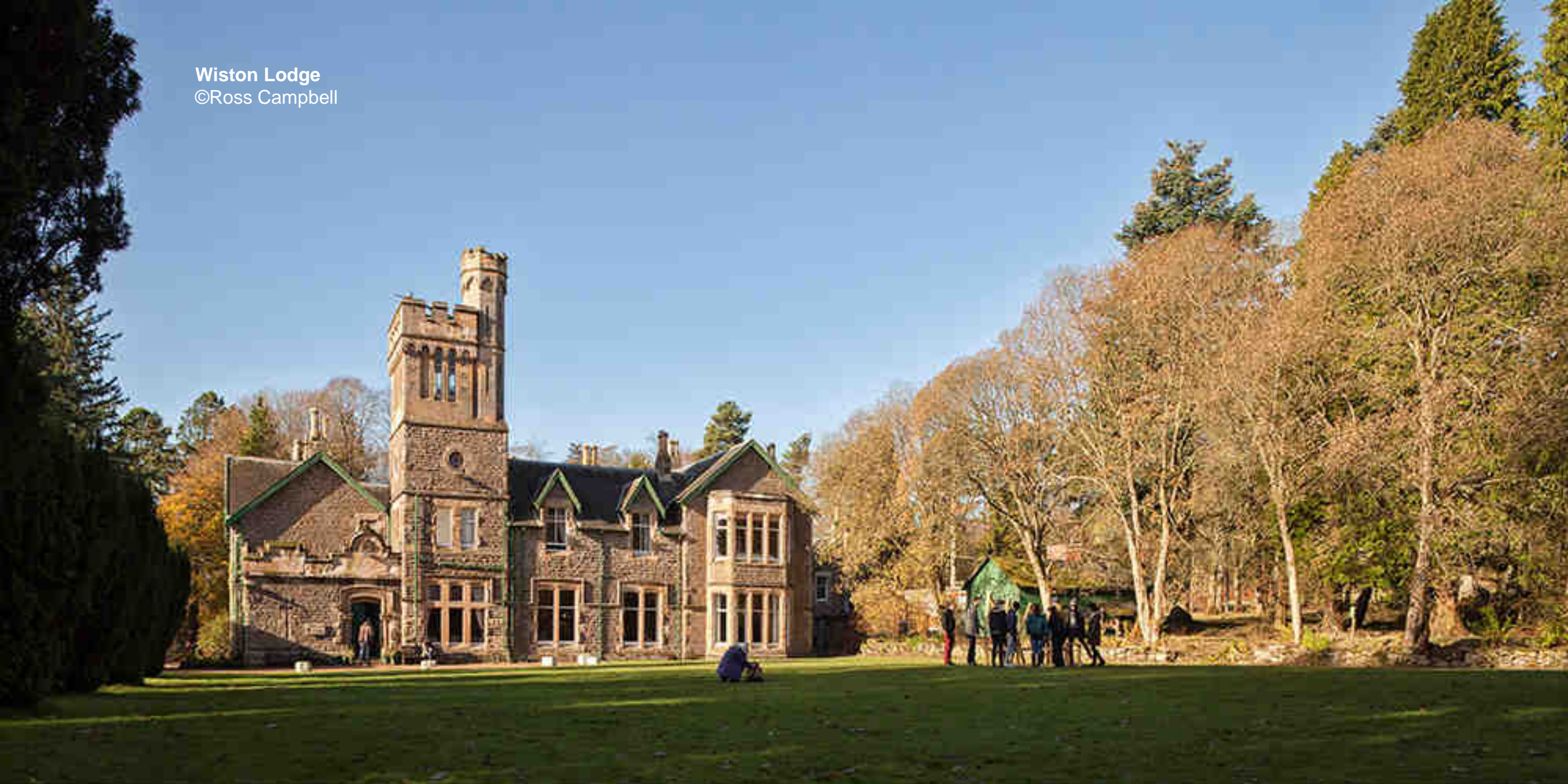
Wiston Lodge ©Ross Campbell