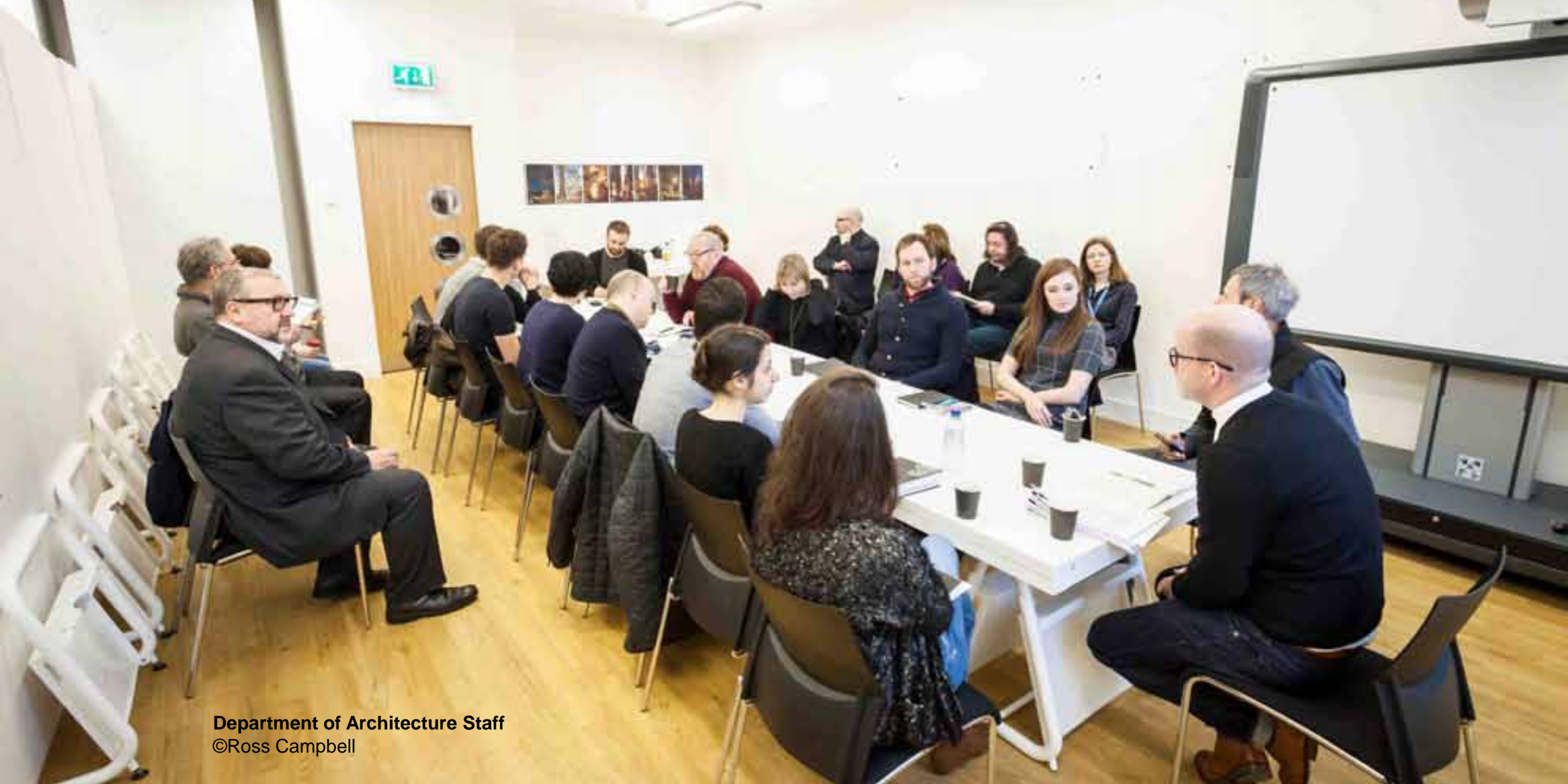
Department of Architecture Staff