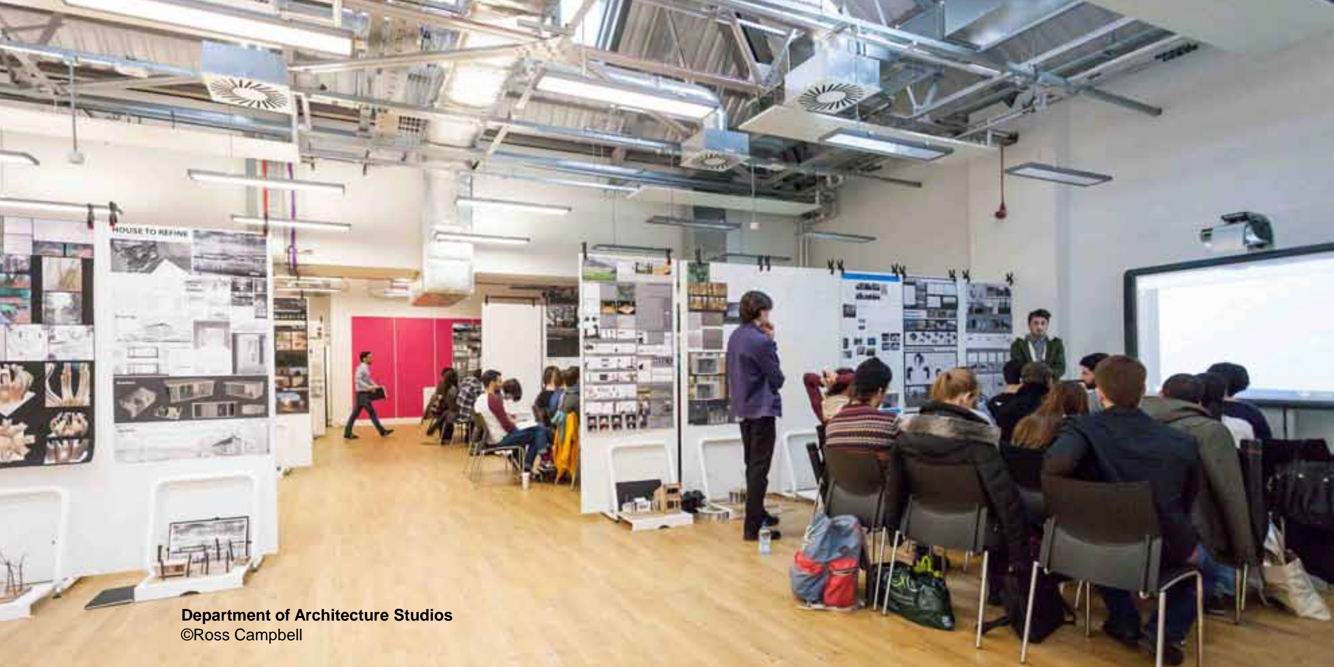
Department of Architecture Studios