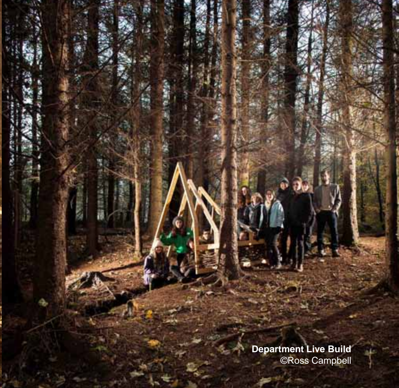
Department Live Build