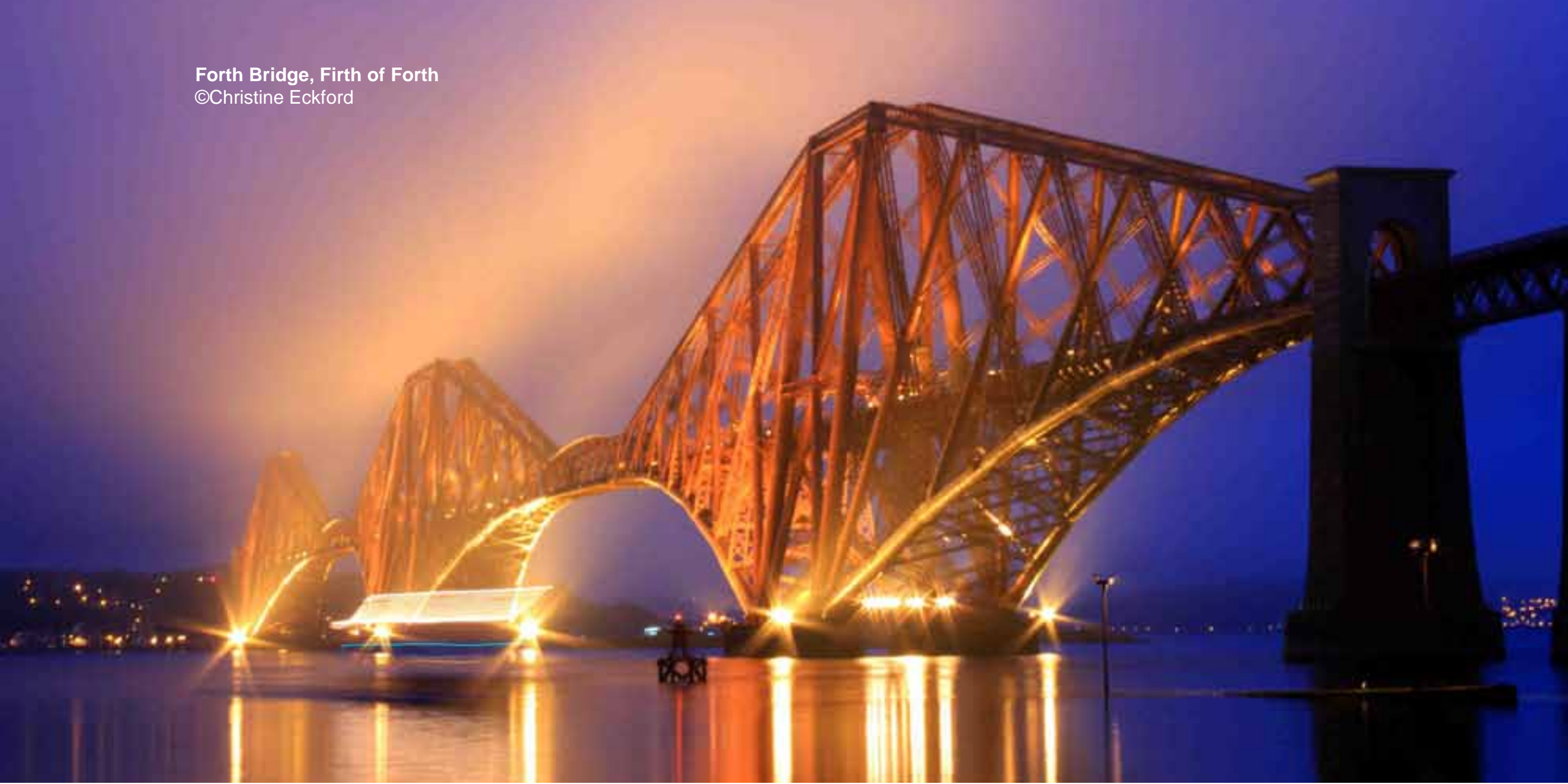
Forth Bridge, Firth of Forth