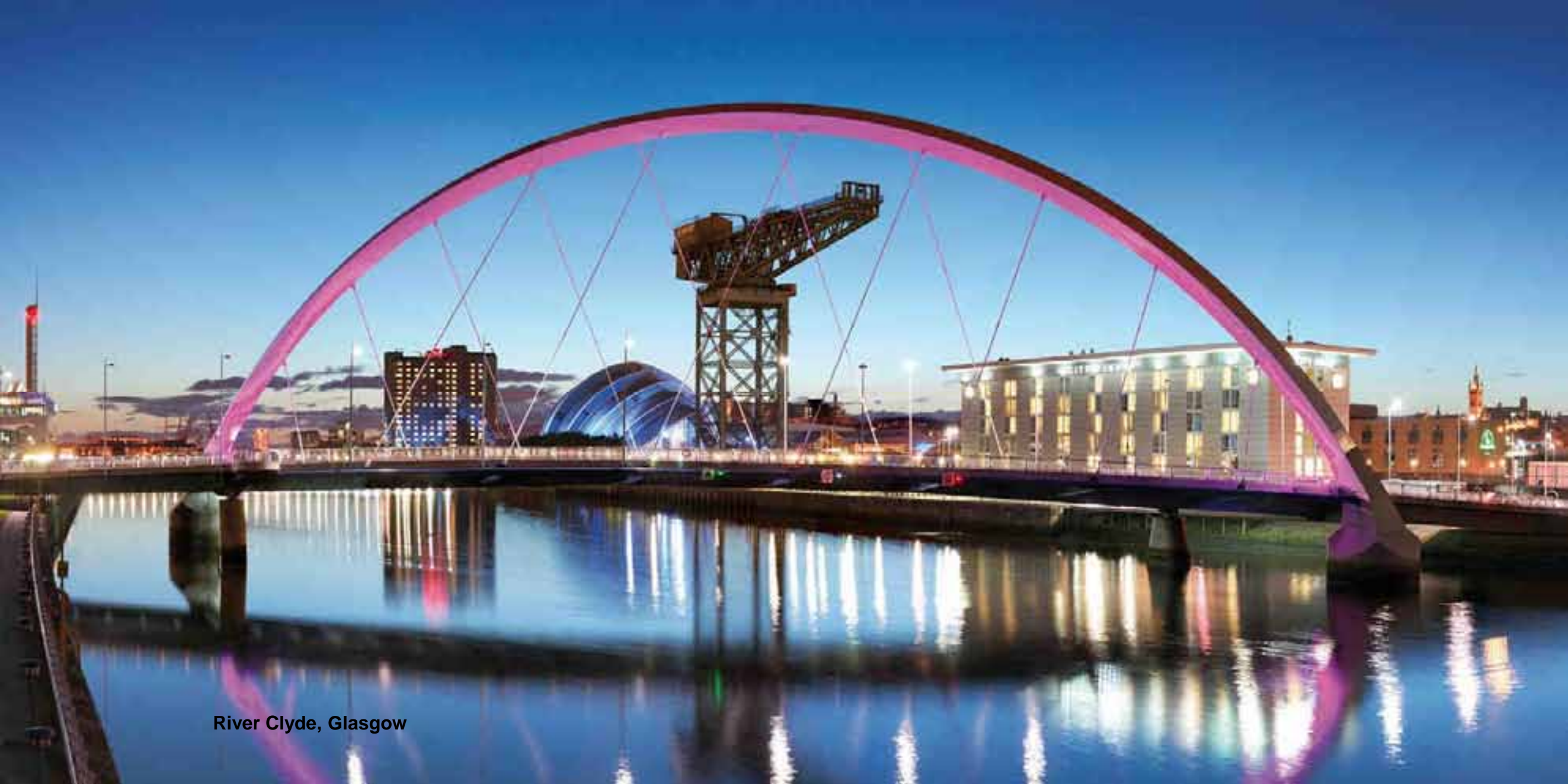
River Clyde, Glasgow