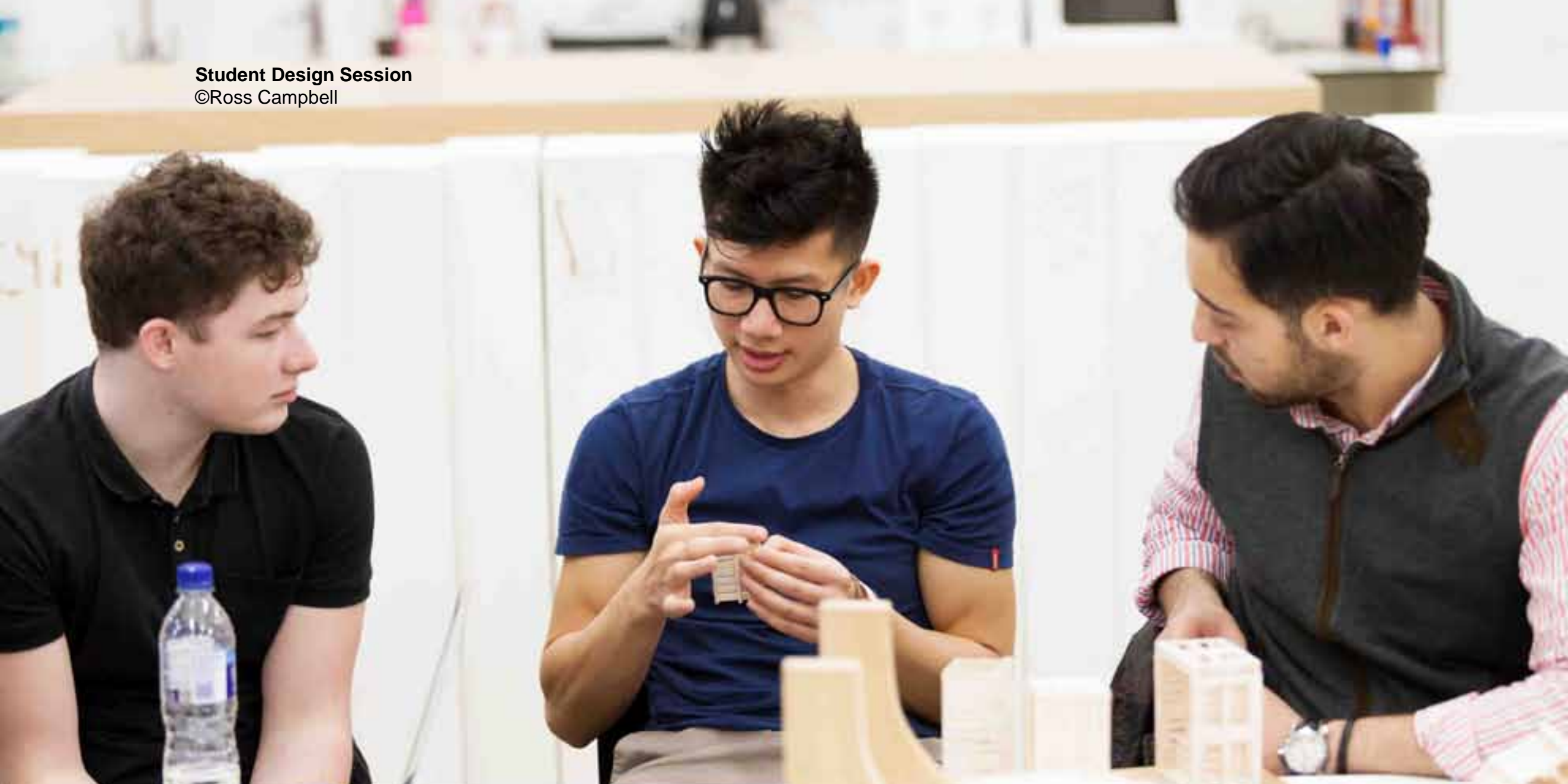
Student Design Session