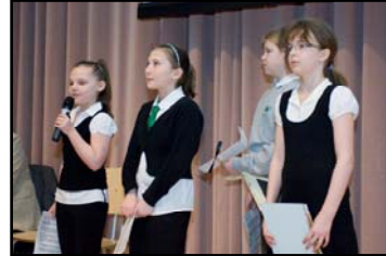
Pupils from Woodlands Primary, North Ayrshire