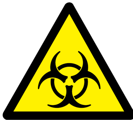
Figure 1. Biohazard sign.

The biohazard sign should be displayed on access points to laboratories, and on equipment such as incubators and fridges/freezers where biological material is used/stored.